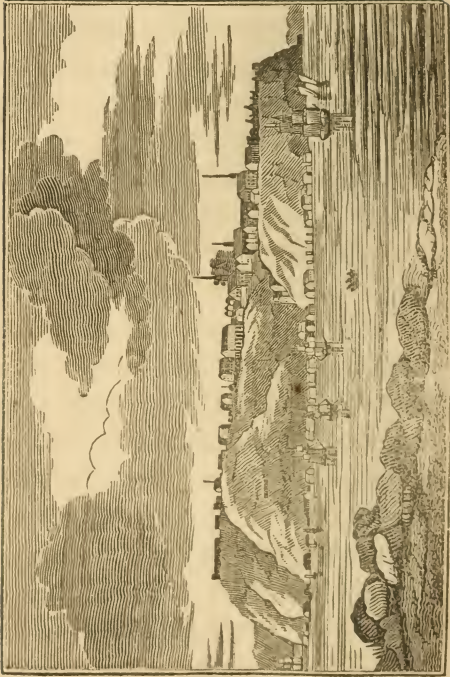
VIEW OF QUEBEC.